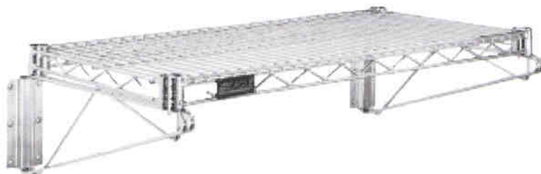
stationary post wall mounts